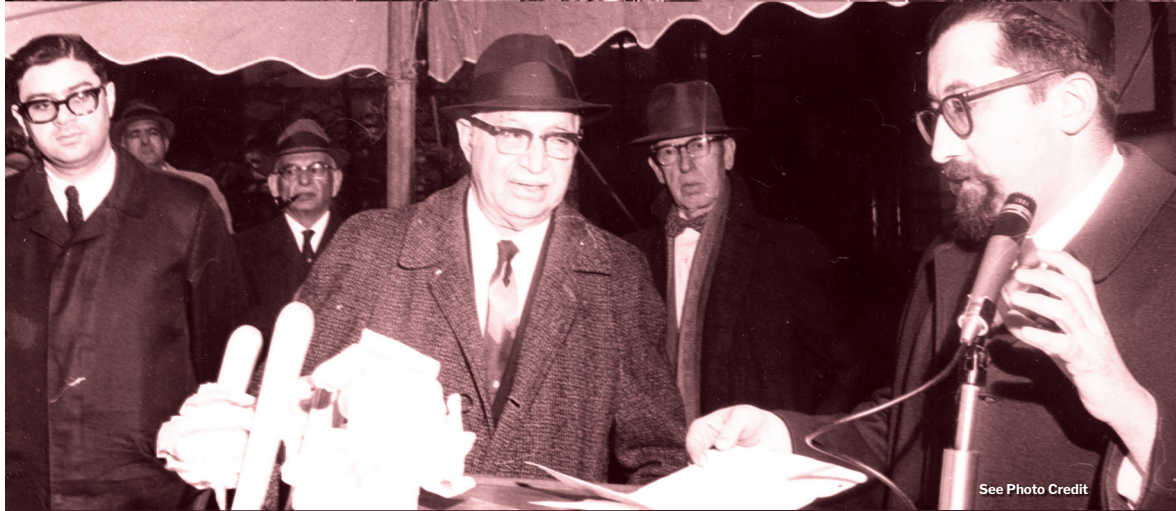
See Photo Credit