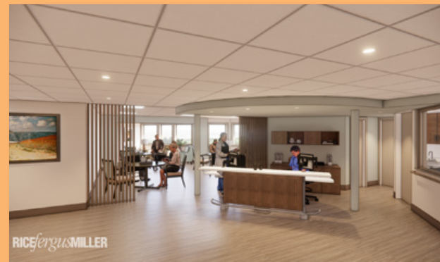
Kline Galland Campus: Nursing Station