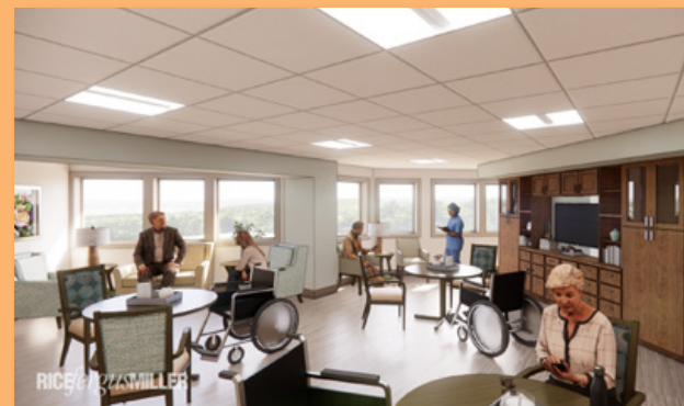
Kline Galland Campus: Resident Lounge